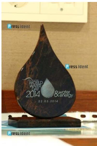
Prizes to photo competition winners

During the Conference the award winners received both money, and real prizes in the form of a drop of water made of stone. They received also certificates.