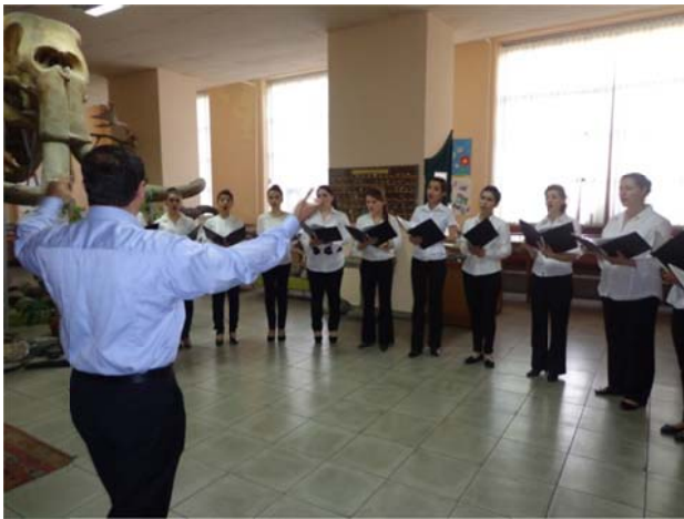
Performance of "Art vocal" chorus