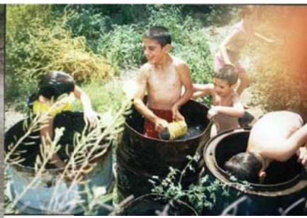
Vardavar (ancient Armenian feast, during which people pour water on each other.)