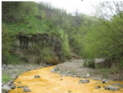
"The Akhtala river asks for help"