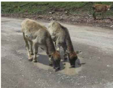
"I wish it would rain down a little more"

An exhibition of photographs sent to the Photo competition was also organized in the Museum, and the participants chose the best photos that should receive awards in 6 nominations.