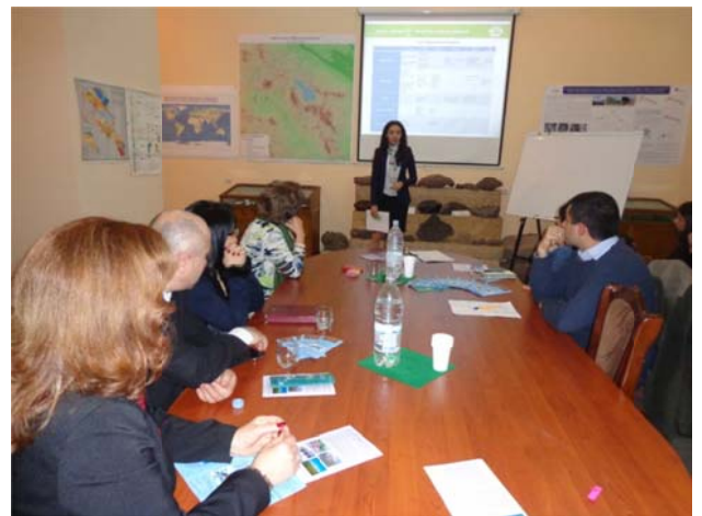
Yerevan Production represented a new initiative, within the framework of which a Water Museum is planned to be established in Yerevan.