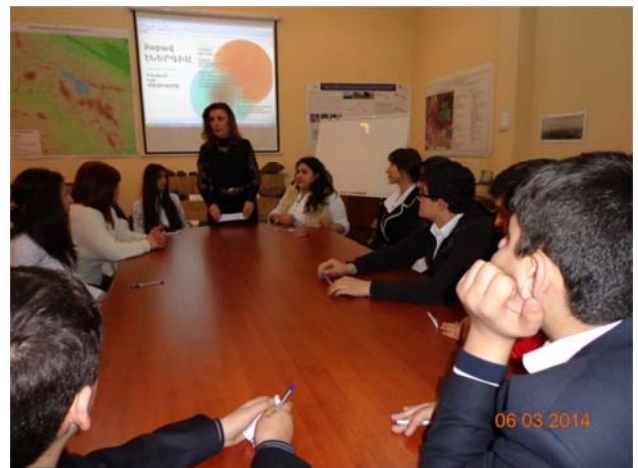
Training session in Geological museum

A report on "Water and Energy" was presented to the participants and their attention was attracted to the studies implemented within the framework of World Bank's "Thirsty energy" initiative.