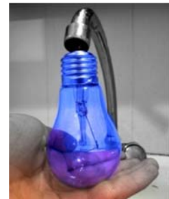
"Water or energy?"

On March 21 the Conference on "Problems in the field of the RA Water Resources" was held, which closed the series of the measures within the framework of "Let us be caring, Armenia – World Water Day 2014" initiative. The conference was attended by the representatives of Ministry of Nature Protection's Water Resources Management Agency, Ministry of Energy and Natural Resources, Ministry of Agriculture, Ministry of Health, water supply organizations, private sector, NGOs, universities, the media, students. Speakers raised water problems and the works carried out for their solution.