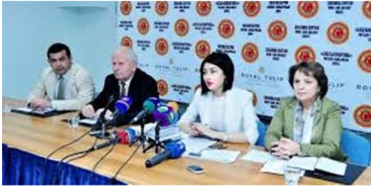
Press Conference on March 18

On March 20, the Geological Museum hosted a scientific conference on "Water in our life".