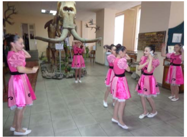
Performance of schoolchildren's dance ensemble.

An exhibition of photographs sent to the Photo competition was also organized in the Museum, and the participants chose the best photos that should receive awards in 6 nominations.